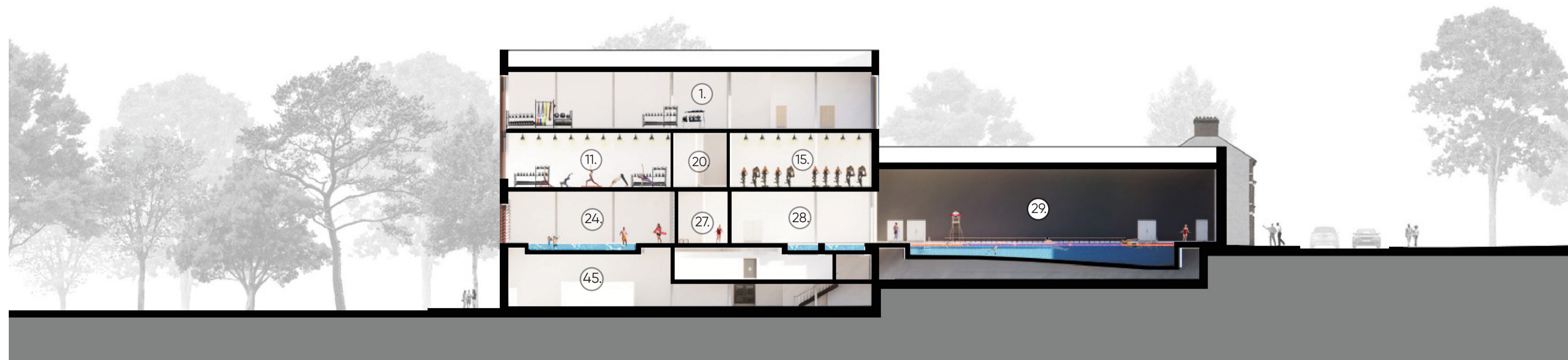
Sectional Drawing of proposed Leisure Centre

A new landmark for Strabane – A key element of the Strabane Regeneration Project.