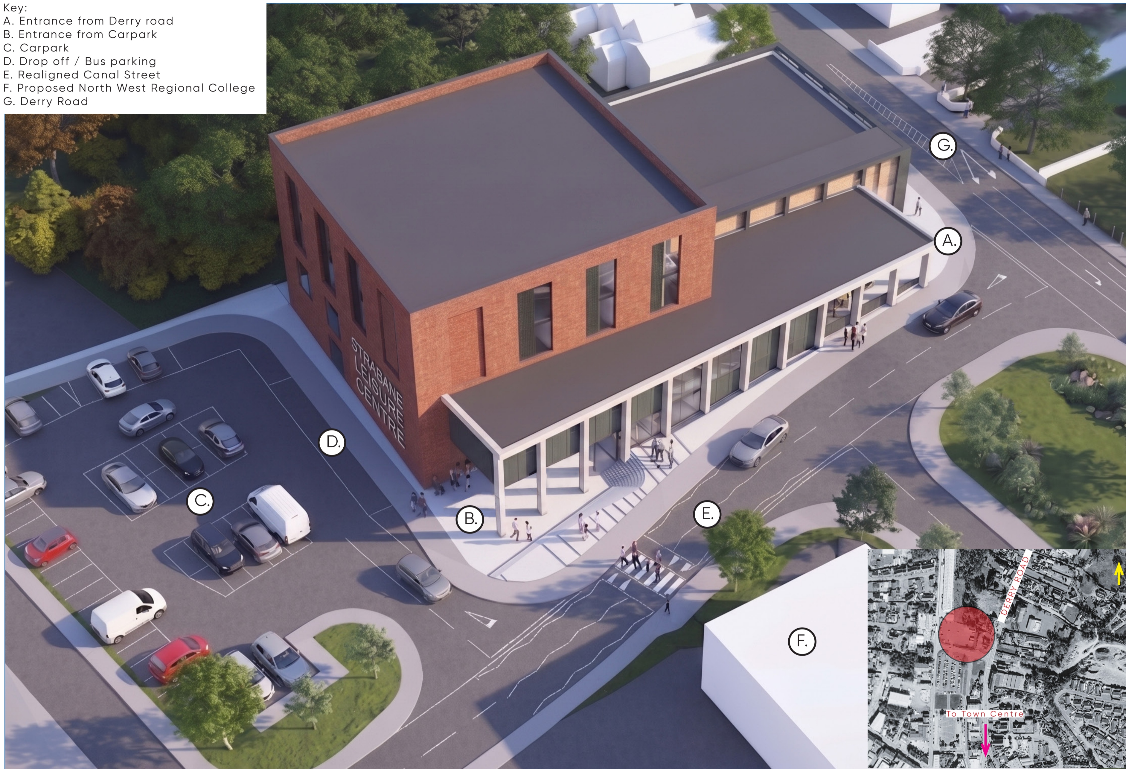
Proposed Site Location

A new landmark for Strabane – A key element of the Strabane Regeneration Project.